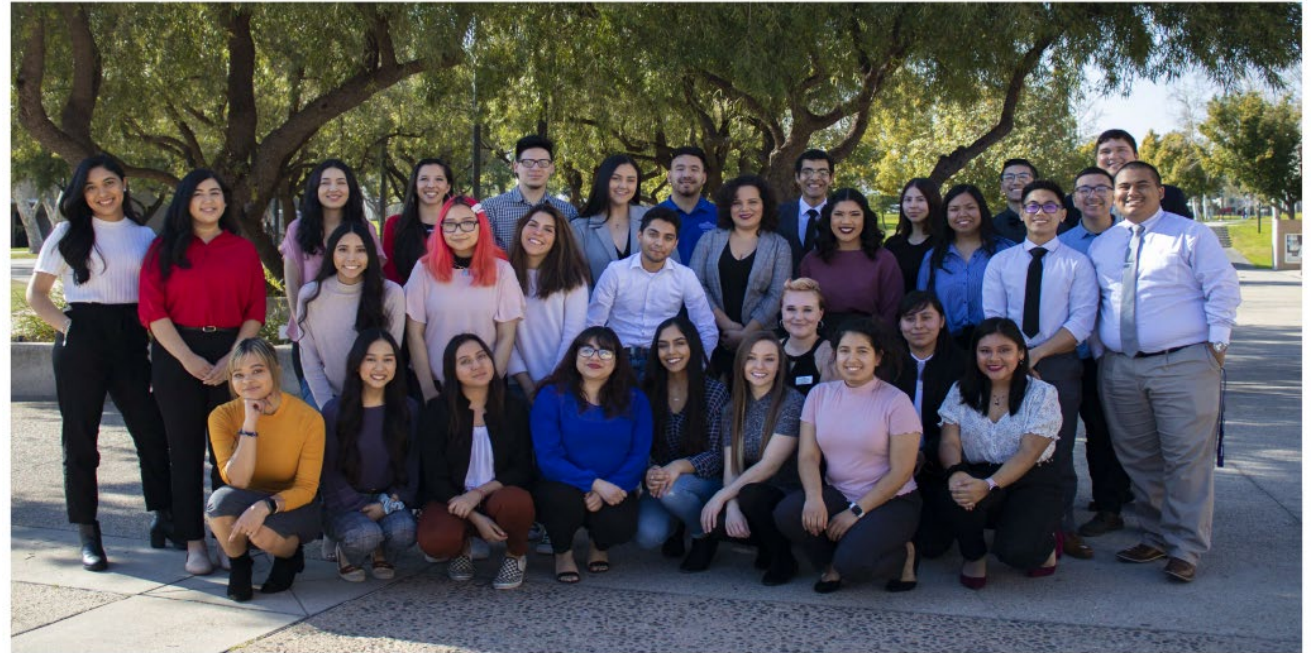
2019-2020 Library Ambassadors

For faculty who teach first-year GE courses with a critical information literacy outcome (Written Communication, Oral Communication, History of the United States, and First-Year (Foundation) Seminar): The Pfau Library and Undergraduate Studies' Student Mentoring offer a peer Library Ambassador program to supplement critical information literacy instruction in the classroom with the goal of centering and establishing connection amongst students, in turn decreasing library anxiety.